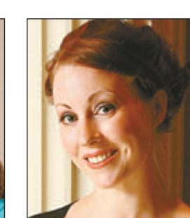
'For a wishful princess, this is the best story assignment ever.' SHANNON PROUDFOOT,