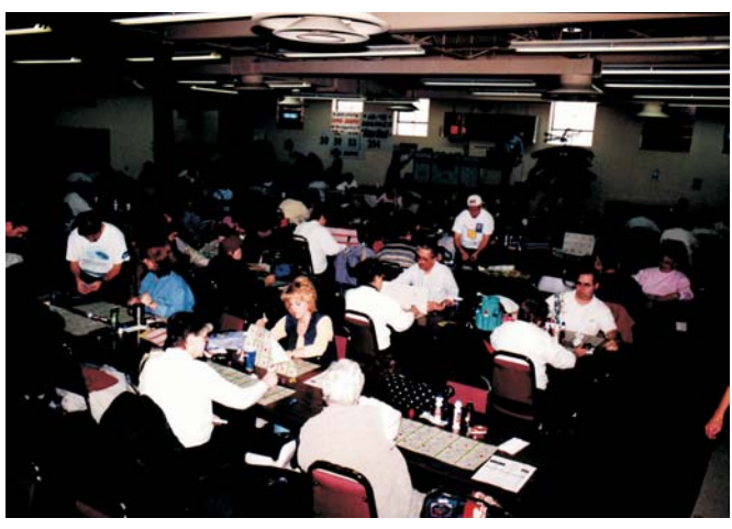
Bingo on January 23, 2000. The bingo players