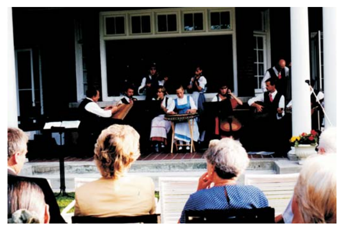
The Alpine Singers music group in concert at the Ambassador's residence. June 23,1999.