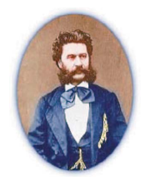
Johann Strauss, Jr.

où le disque compact et internet représentaient les moyens de communication d'un futur fort éloigné. Il ne figure maintenant au programme des différents orchestres symphoniques que dans le cadre de bals ou de concerts béné fices. Un bien triste sort, pour un compositeur