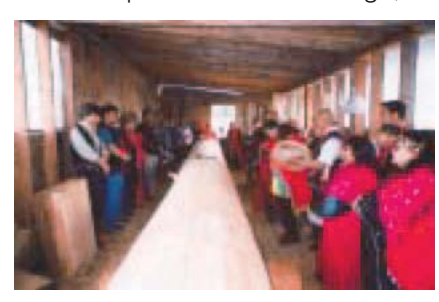
Pole blessing ceremony in New Aiyansh.

Looking at the pole, one can see an eagle in flight, with its wings spread wide, at the top of the pole. The other figures carved into the pole are a wolf, a killer whale and a raven, which together represent the four major crests of the Nishga'a people. Sub-crests, such as a beaver, an owl, a frog and a bear, were also incorporated into the design, as