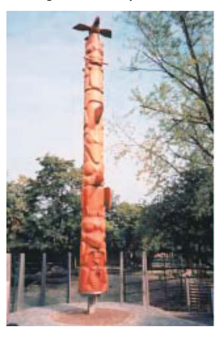
The totem pole at its final location at the Zoo in Schönbrunn.