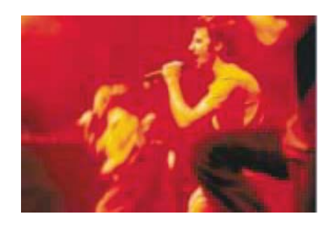
Source: http://www.bauchklang.at/home _e_ flash.html. December 2, 2002.

"not without a minor feeling of doubt concerning our jazzfestivalcompatibility, we flew to montreal—