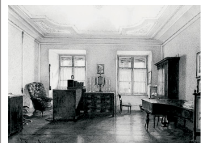
Franz Grillparzer's living room with desk and piano in his flat in Spiegelgasse, 1st district of Vienna. Water color by F. Alt, 1872.