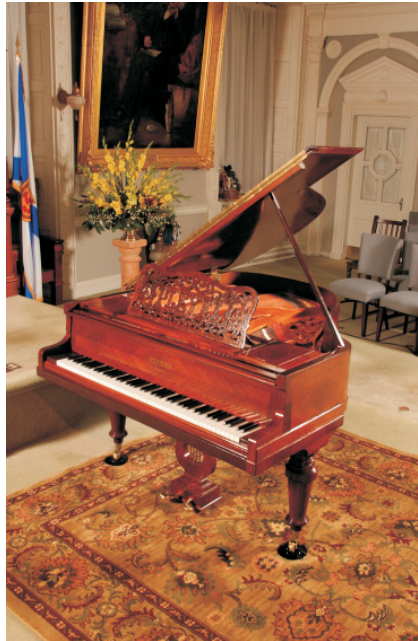
Picture of the Pleyel Piano in the Legislative Assembly Chamber during the Gala on March 18, 2004.

On March 18, 2004, a Black Tie Gala Performance and Reception was held to officially mark the acquisition of a fully restored, circa 1910 Pleyel (Paris) grand piano for Province House. Although the Pleyel Piano company was located in Paris, its founder, Ignace Joseph Pleyel, was born at Ruppersthal, Austria on June 18, 1757. Pleyel was also a student and then a friend of Joseph Haydn, one of Austria's most well-known and influential composers.